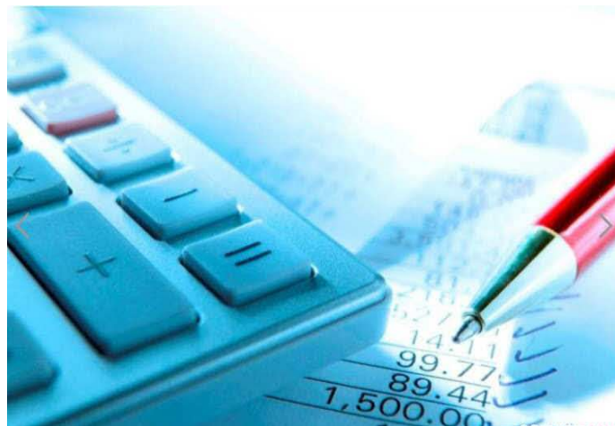
Figure 2 Tax planning

The responsibility of small and medium-sized enterprises for tax planning is not clear, many people think that tax is only the main work of the financial department of the company, but in fact, there is an inevitable connection between tax and accounting, and it is not only the embodiment of accounting function, but also involves various aspects of enterprise production, financing, sales and distribution, and has a direct connection with the overall operation process of the enterprise. However, many enterprises have no clear responsibility for tax planning, which leads to the heavy task of the financial department, the lack of tax awareness of the relevant business personnel who pay more attention to the performance appraisal and business development, and when there is a contradiction between the tax standard and the personnel, it will tend to bias the business personnel, which will affect the financial affairs of the enterprise itself, and lead to the financial risk of the enterprise.[4].