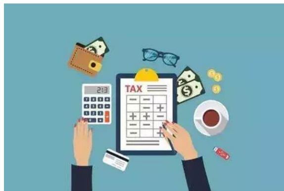
Figure 3 Corporate taxation

Small and medium-sized enterprises should ensure the comprehensiveness and coverage of the tax planning work, which is very important for enterprises to reduce their own tax burden. In order to improve the comprehensiveness of tax planning, enterprises need to have a comprehensive and clear understanding of related matters, and be able to carry out tax planning work according to the actual situation, and formulate the basic system of tax planning, so as to better guide and standardize the work. In addition, small and medium-sized enterprises should also effectively divide the contents of tax planning work, so as to effectively carry out relevant work according to different levels. Through the rational planning and division of tax planning, the scope of the work can be expanded, thereby enhancing the tax planning capacity of small and medium-sized enterprises[6].